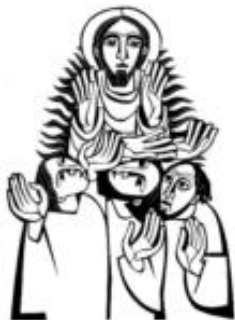
Text: Philip J. Sandstrom. STD © 2001. OCP. All rights reserved. Illustration: © 2011 M. Espamer OSB